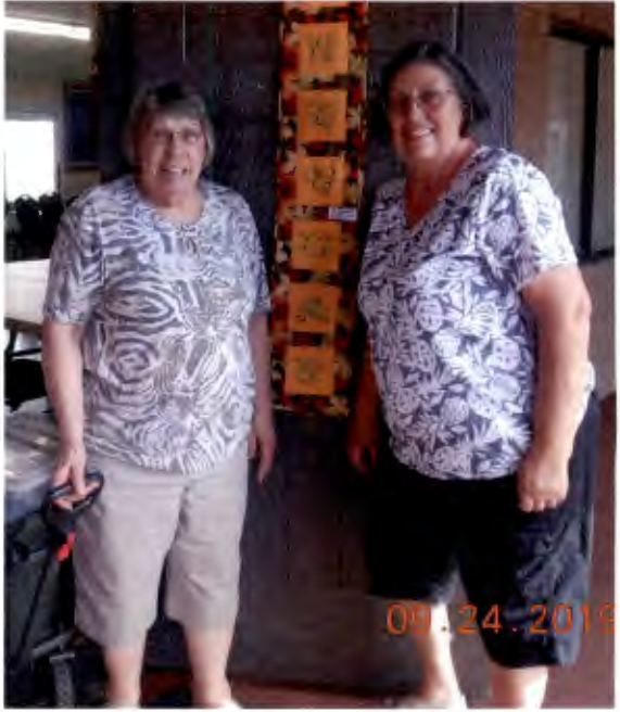
Quilting throwback days

A note from the manager. I want to welcome our new residents that have joined us this past year. I know we have not been able to do a formal introduction & welcome party for you but we are certainly glad you are here. Wow, where did the time go? We accomplished so much since August 2019. Imagine that! I joined the Pueblo Grande Team last year. Looking forward to many more years here with new & exciting plans in the future for 2021.